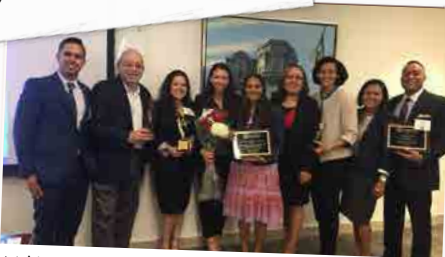
MAHA Awards, October 2017