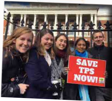
State House Rally, November 2017

In October 2017, the PAIR Project was named the Organization of the Year by the Massachusetts Association of Hispanic Attorneys (MAHA).