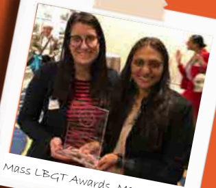
Mass LGBT Awards, May 2018

PAIR was honored to have been named a 2018 Social Innovator by the Social Innovation Forum. The Social Innovator Accelerator helped PAIR gain visibility, expand their networks, and build capacity. PAIR participated in the SIF Social Issue Talks, speaking on justice for immigrants, and debuted its pitch at the annual Social Innovator Showcase.