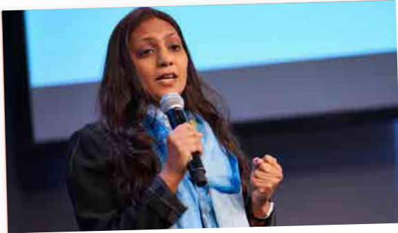
Social Innovator Showcase, May 2018

PAIR was honored to have been named a 2018 Social Innovator by the Social Innovation Forum. The Social Innovator Accelerator helped PAIR gain visibility, expand their networks, and build capacity. PAIR participated in the SIF Social Issue Talks, speaking on justice for immigrants, and debuted its pitch at the annual Social Innovator Showcase.